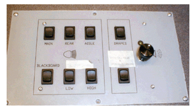
Figure 2. The HC-12 controlled physical button panel as an alternative to a graphical touch-screen interface. This panel provides manual override control of the room lights, projector, screen, drapes, and volume, without the need for distracting, hierarchical menus. Furthermore, the volume knob is context-sensitive, adjusting either the volume of the VCR when a tape is playing, otherwise, that of the instructor's microphone.

We also designed a Motorolla 68HC12-controlled panel, pictured in Figure 2, to provide physical switches for manual control over the room lights, drapes, projector power, and screen, and a rotating knob that adjusts VCR and microphone volume, depending on which is in use. The controller also accepts input from a number of other devices such as light sensors embedded in the whiteboard pen holder, serving as switches to indicate that a pen has been removed.