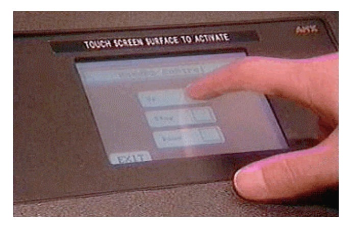
Figure 1. The AMX touch-screen interface, displaying the screen-control sub-menu of the hierarchical menu. In order to navigate to another function, the user must first press the EXIT button at the bottom left of the screen.

Among the numerous designs for room control interfaces, the Centre for Educational Technology and Distance Learning at the University of Birmingham designed a reconfigurable graphical interface that provides users a different set of controls based on the event taking place (e.g. local meeting, videoconference). The benefit of this approach is that by minimizing the number of controls to those that are immediately relevant, the interface retains its flexibility while reducing complexity of operation. Unfortunately, the hierarchical structure of earlier interfaces remains, meaning that users still need to navigate between menus.