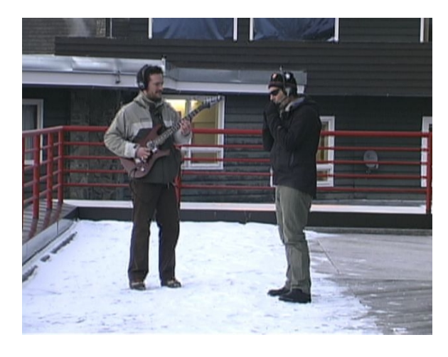
Figure 3: Two participants jamming in a virtual echo chamber, which has been arbitrarily placed on the balcony of a building at the Banff Centre.

Approaching mobile music applications from the perspective of virtual overlaid environments, allows novel paradigms of artistic practice to be realized. The virtualization of performer and audience movement allows for interaction with sound and audio processing in a spatial fashion that leads to new types of interfaces and thus, new musical experiences.